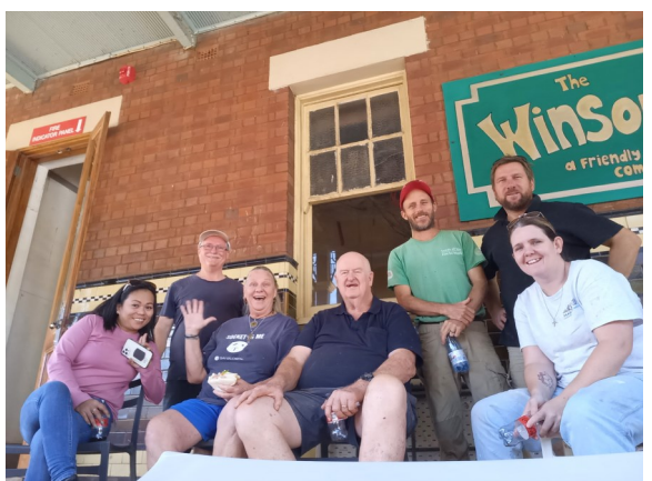
Various teams worked tirelessly in the initial post-flood clean-ups. We are so grateful for everyone's help and support

We have been blessed with the generosity of the community, both locally, nationally and even some international gifts, and take seriously our responsibility to be good stewards of this money.