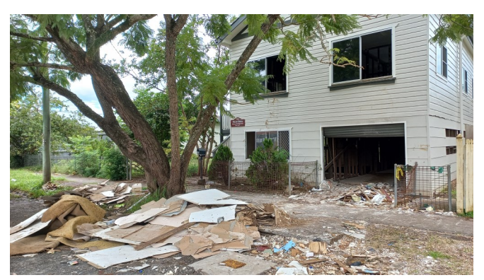
"Mazzer House" in Casino Street, during the first cleanup