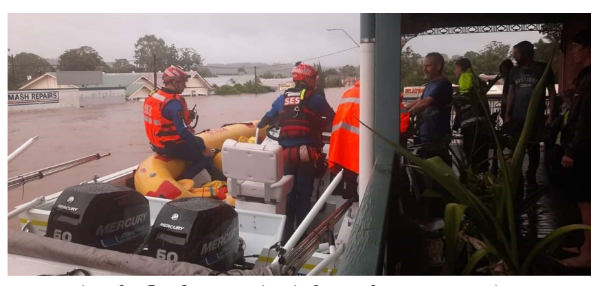
During the flood evacuation in late February, our winsome verandah become a drop off spot whilst people waited for larger boats to ferry them across the river to safety.