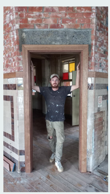
one of our amazing team with the freshly renewed door frame - post flood repairs